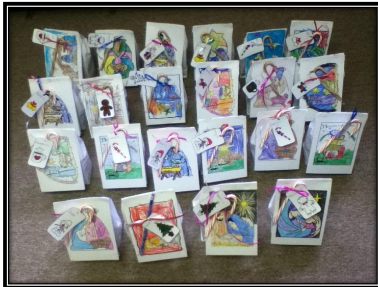
VHCA students and staff took up a money collect and the elementary students colored cards that were attached to goodie bags that were given to the CWS clients who come and clean the VHCA facility twice a week.